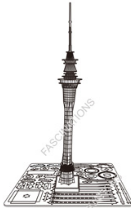
Auckland Sky Tower Item No. MMS029