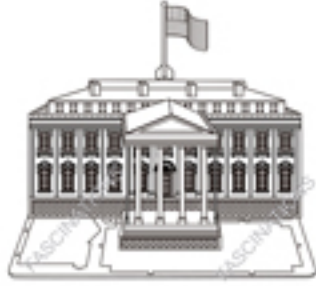
The White House Item No. MMS032