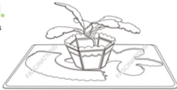
Sago Palm Tree Item No. MMS021